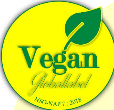
Figure 7: Green-Yellow Alternative Logo