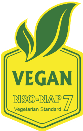
Certificate No: XXXXYZ Figure 1: Yellow-Green Logo

3.16 Logo / License / Sign / Symbol / Trademark / Label Format examples are as follows.