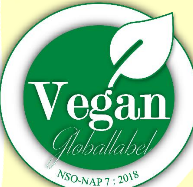
Figure 8: Yellow-Green Alternative Logo