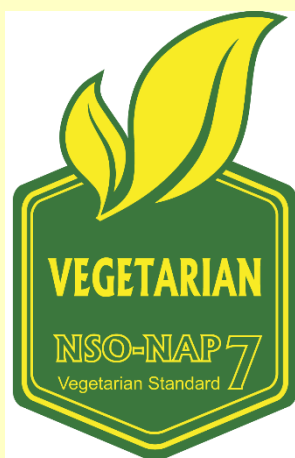
Certificate No: Certificate No: XXXXYZ Figure 5: Green-Yellow Logo