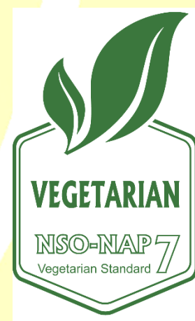
Certificate No: Certificate No: XXXXYZ Figure 6: Green-White Logo