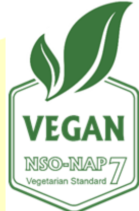
Certificate No: XXXXYZ Figure 3: Green-White Logo