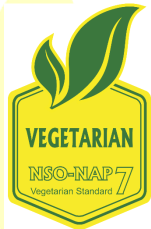
Certificate No: Certificate No: XXXXYZ Figure 4: Yellow-Green Logo