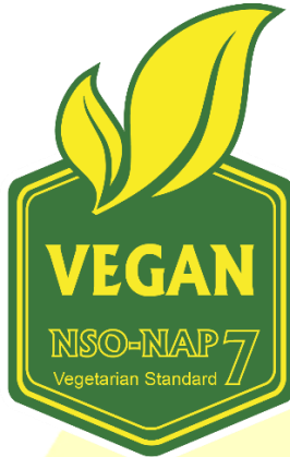
Certificate No: XXXXYZ Figure 2: Green-Yellow Logo